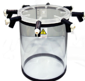
LSDCV 8-Port Acrylic Chamber