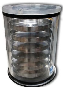
LSAD6 Chamber and Tray Drying Accessory

This robust design includes a smooth wall, stainless steel ice condenser with a front mounted bottom drain and USB connection. The LyoDry Benchtop was originally designed as a direct replacement for the Edwards Modulyo® benchtop freeze dryer. Many standard Modulyo drying accessories (e.g. acrylic chamber, tray drying accessory, etc) are directly interchangeable, offering significant cost savings if only the condenser needs replacing. Choose from a variety of LyoDry accessories to accommodate bulk materials, flasks, vials and ampules.