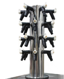
LSPM24 24-Port SS Drying Manifold

UK designed, manufactured and supported, the LyoDry Benchtop Pro offers a superior, keenly priced, freeze drying solution with enhanced functionality, ideal for freeze drying a wide variety of samples.